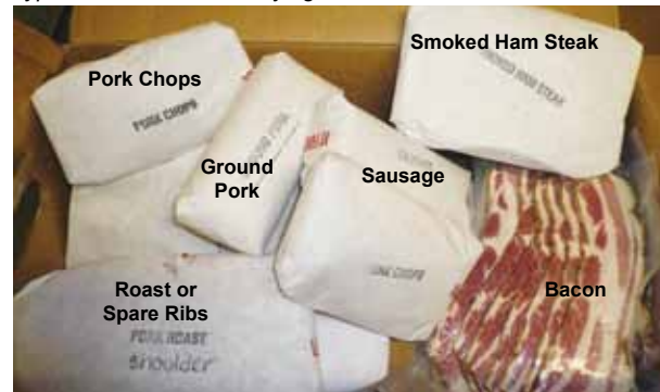
Typical Standard Pork Buying Club Box

Nash's Organic Produce Pork Program 4681 Sequim-Dungeness Way Sequim, Washington 98382 www.nashsorganicproduce.com 360-681-6274